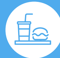
On-site café for casual indoor/outdoor dining