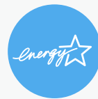
Energy Star efficient