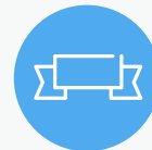
High identity signage available