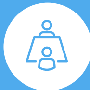
Conference room that fits up to 30 people