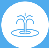
New pedestrian-friendly courtyard with shaded outdoor meeting areas around a central fountain